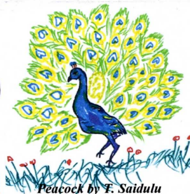
Peacock by F. Saidulu