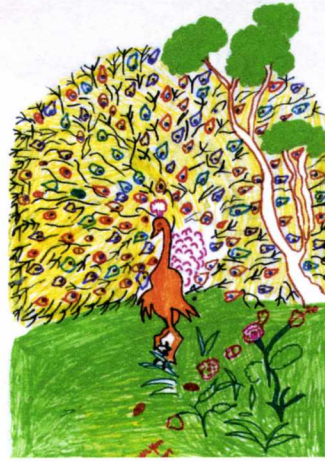
Peacock by Guntipalli Saidulu