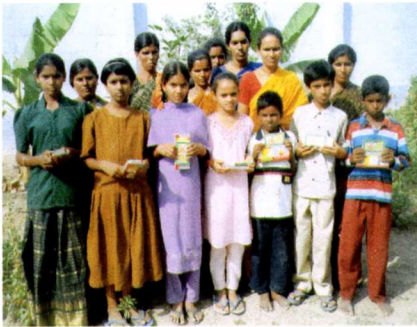
2004 art award recipients

As the school year comes to an end, academic achievement and most improved student awards will be presented to the children. The awards program is funded by special contributions and will be continued and expanded as donations allow. New award categories such as math, art, science, language, etc. may be added to the program. Donations to the awards program may be made in your name, in celebration of any special occasion, or in memory of a loved one.