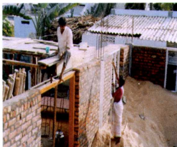
Masons & Unloading Concrete

Construction of the first floor of the Life Light Community Center began in October '04 and is expected to be completed in June '05. Thank you to all who have contributed to the project and to those whose volunteer efforts have made this community dream a reality. To date, fund raising efforts have provided for the entire construction of the first floor. Still needed are first floor furnishings for the two offices, meeting hall, dining area, kitchen, and food pantry. Fund raising for the second floor of the Community Center will begin this year.