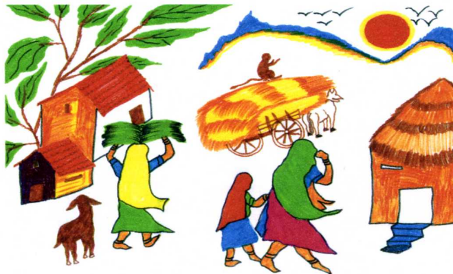
Mattamapally by Arala Venkatesh

New Indian School Year Educational sponsors for 300 children grades k-10 and elder care sponsors for 100 homeless, elderly men and women are needed for the new Indian school year, June '05 - May '06 (see photos). A one semester sponsorship is $120 and a full year sponsorship is $240. First semester fees are due to the HEARTS' CRY office by April 1. To arrange an extension of the deadline, please call Ellen Wheeler at 607-272-7164.