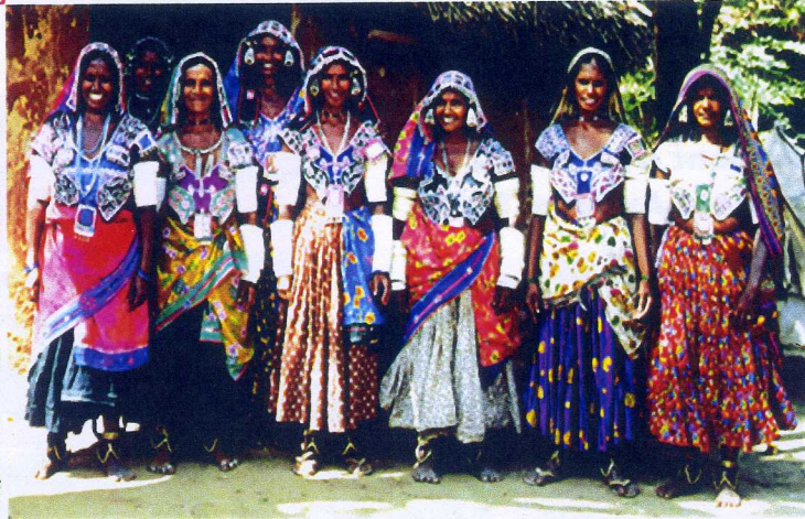
Lambada tribe women in neighboring village

HOT MEALS FOR KIDS Malnourished children may participate in the hot meal program, two meals per day. A six month plan is $120.