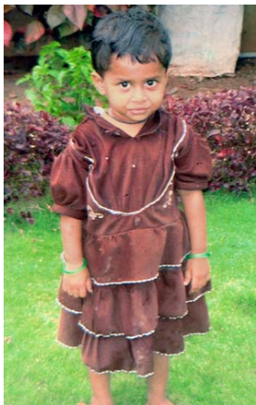
Chinthala Sindhuja Nursery School

One-year sponsorship, $260 Six-month sponsorship, $130