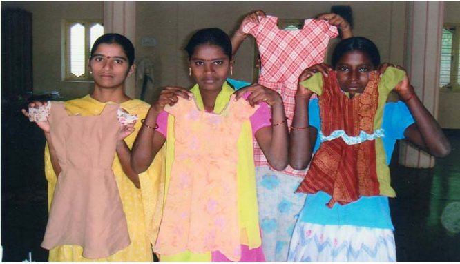
Community Center sewing program participants.