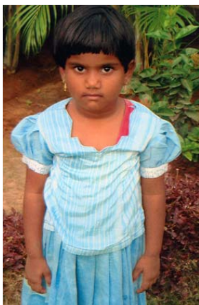
Thrimal Reddy Kindergarten

Parents are day laborer and shepherd; thatched roof house w/o latrine ($200/yr income).*